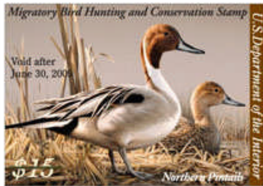
75th Anniversary Federal Duck Stamp winner - Joe Hautman

For every dollar you spend on Federal Duck Stamps, ninety-eight cents go directly to purchase vital habitat for protection in the National Wildlife Refuge System. The Migratory Bird Conservation Commission (MBCC) oversees the use of Federal Duck Stamp funds for the purchase and lease of wetland habitat. The MBCC also reviews, but does not approve, the use of Federal Duck Stamp dollars for the purchase of small natural wetlands and their associated uplands for preservation as Waterfowl Production Areas (WPAs) .