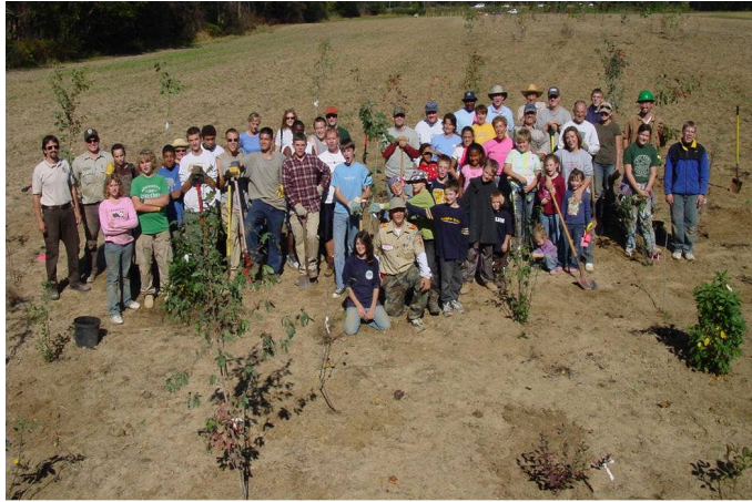
Volunteers celebrate the completion of planting phase one of Field 21