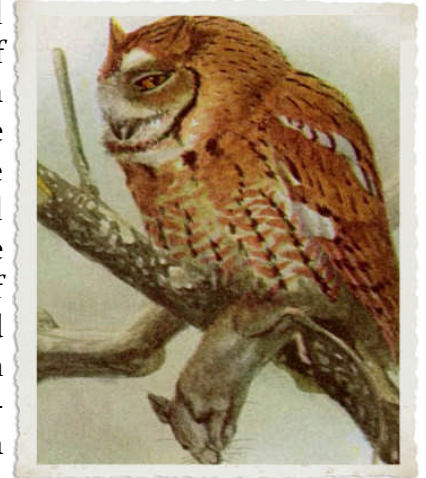
Eastern Screech Owl (red-phase)

Sheariness and a Peregrine Falcon at the Allee House. On the 3rd a Snow Bunting was seen near Bear Swamp and some 14 Common Mergansers on the bay side of Sheariness. A single Lapland Longspur was seen near the Visitor Center on the same day. The American Bittern was still at Sheariness on the 8th. On Big Woods Pond, on the road to the Allee House, there was a pair of Hooded Mergansers on the 9th. An early Woodcock was seen displaying on the 15th near Raymond Pool and a pair of Brown Thrashers were seen along the Parson Point Trail that day. Large numbers of Green-winged Teal were seen on the 18th. A red-phase Eastern Screech Owl was seen in the Wood Duck Box near Sheariness Tower that day. A Cooper's Hawk was spotted checking out the Finis Pool area on the 20th and a couple of Eastern Towhees were also at Finis. There were 14 American Wigeons near the Allee House on the 24th. The month closed with the sighting of an American Bittern at Bear Swamp.