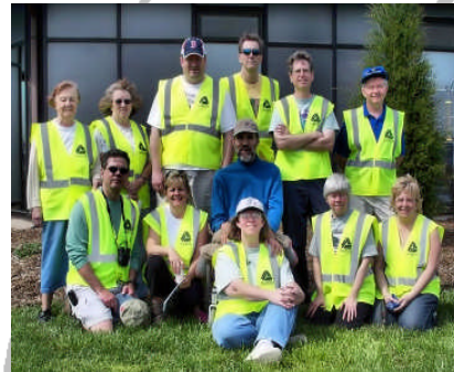
Bombay Hook Volunteers at the Spring Highway Clean-Up

Thanks to a good turnout and near-perfect weather, the roads leading to the refuge were cleared of trash in record