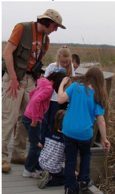
Animal Tracking Program