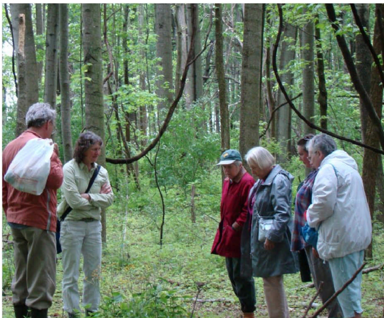
Spring Wildflower Walk