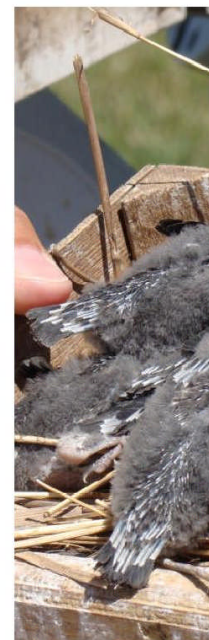
14 Purple N

During the 75 th Anniversary Year – 2012, App Over 11,200 People Were W Over 1,900 People Participated in 50 Pr Approximately 2,000 Students attended Environ Over 1,900 Deer and Waterfowl