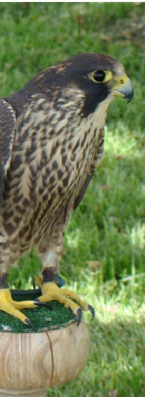
Peregrine Falcon Nest Box Program