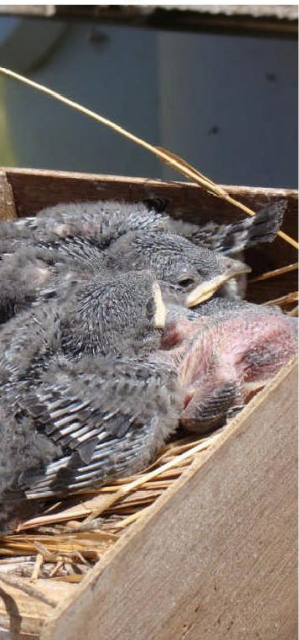
4 days old Nest Box Program