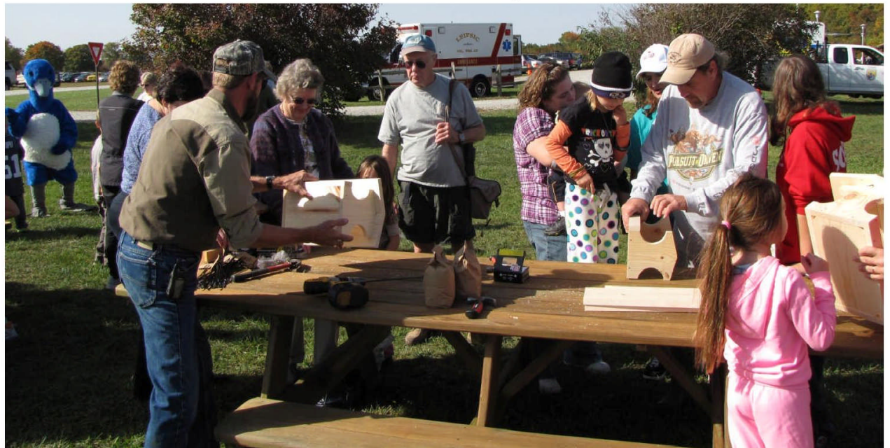
75 th Anniversary Festival

Approximately 100,000 People Visited The Refuge.