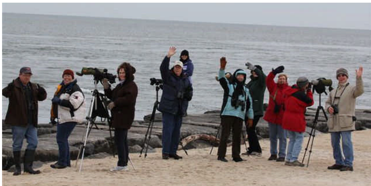
A happy group of Bird Club members kick off 2013 with a trip to the Indian River Inlet.

The Friends' Bird Club began 2013 with the third annual New Year's Day outing to the Indian River inlet, the IR marina causeway and Silver Lake in Rehoboth. It was a delightful and productive day. Later in January, road and tidal conditions at Port Mahon led to a last minute change, and the club looked for owls and hawks above the salt marshes at Bombay Hook.