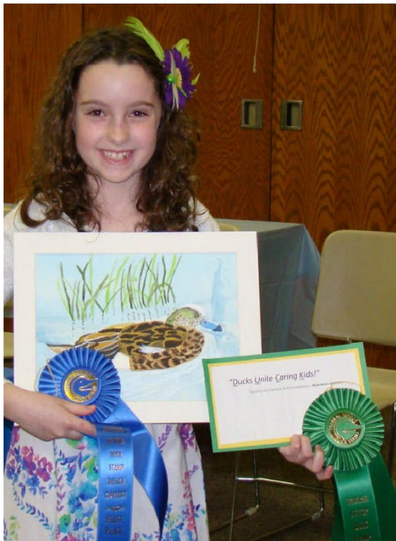
Delaware State Junior Duck Stamp Contest