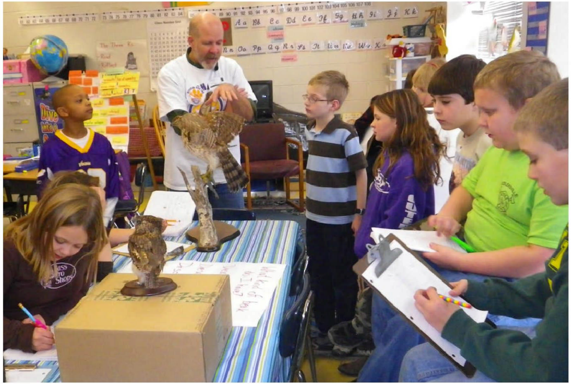
Off-site School Programs