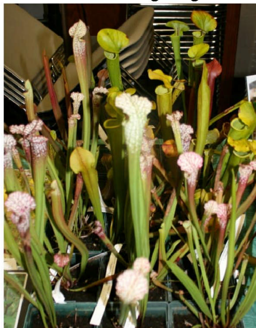
Bog Gardening Program