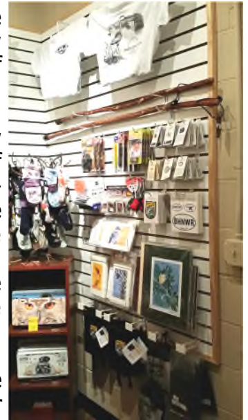
The Blue Heron Gift Shoppe is now open!

We have in stock a number of items that feature the new America The Beautiful Bombay Hook Quarter! We have a proof set, a coin with stamp set, and a tri-fold 2-coin set with quarters minted from both Denver and Philadelphia. We also have some nice lapel pins and key chains that were made in the quarter's likeness. And did I mention we have two very special pieces....a beautiful money clip and a sterling silver necklace with real quarters set in them! Ask at the counter to see these beauties!