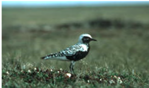
Black-Bellied Plover

In addition to hundreds of Dowitchers, Stilt and Western Sandpipers, Semi-palmated Plovers, Black-necked Stilts, Black-bellied Plovers, and Spotted Sandpipers were easily observed by Refuge visitors on the wildlife drive. Migratory Peregrine Falcons frequently put on aerial acrobatic displays while chasing the shorebirds. American Avocets peaked at over 500 birds in early September.