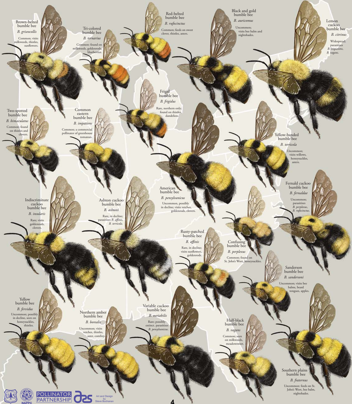
Brown-belted bumble bee

There are 47 bumble bee species in the entire United States and they are among our most important pollinators. These charismatic bees visit flowers with long corollas and abundant nectar. Bumble bees are important as commercial pollinators of tomatoes, along with certain wildflowers, which they buzz pollinate, turning themselves into living tuning forks to harvest their pollen grains. At least 6 species in the U.S. are in trouble. Visit www.pollinator.org for more information and to see how you can help.