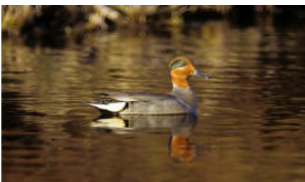
Green-Winged Teal

Waterfowl migration was just beginning at the close of the report period. Shovelers, Blue- and Green-winged Teal, and Pintail were observed but no significant influxes of large numbers of ducks and geese were noted. The production of three Mute Swan cygnets caused concern since this is an invasive species and hope it will not become numerous on the Refuge in the future.