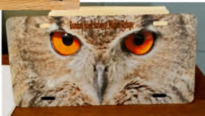
We have nature drink coasters (top) and photo Bombay Hook license plates (bottom) for the nature lover.

We hope to have a special Before the Holidays Sale coming up in the next month or so. We will be advertising the exact dates at the Visitor Center and on our Facebook page, or you can always call (302) 653-8322 and ask for the dates and times.