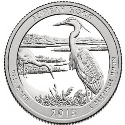
America the Beautiful Bombay Hook Quarter

As fall moves into winter, and the landscape and wildlife transition, the Refuge still contains wonders to observe – waterfowl, lone waders, hunting raptors, and the patterns and colors of frost, ice and snow. Some Great Blue Herons and maybe an occasional Great Egret will still be on the Refuge, reminding us of the release of America the Beautiful Quarter in September. Check with your local bank if they have rolls of this quarter available ($10 per roll of 40 quarters); merchandise related to the Quarter is available at the Friends' Blue Heron Gift Shoppe.