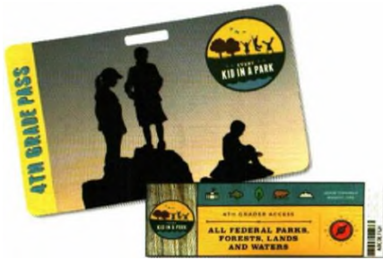
The pass (top) or paper voucher (bottom) allows fee-free entry.

By participating in the Every Kid in a Park program, 4th graders and their families can visit and learn about Federal lands and waters right now. Ignite a passion for history and culture and spark a lifelong commitment to saving places that matter. Learn about opportunities for classroom activities or ways to become involved in protecting these special places.