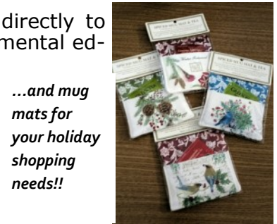
...and mug mats for your holiday shopping needs!!

We have a couple of smaller items that are new for the holiday season of gift giving. We have mug mats, playing cards, bird puzzles and a birder crossword puzzle book to name a few. The Blue Heron Gift Shoppe will be having a Winter Sale starting December 1 and ending when we close for the season later in the month (date of closing to be determined). Everything in the store will be 15% off of the regular and marked down prices, with the exception of the hand-painted Marcia Poling ornaments. And don't forget.....Friends of Bombay Hook members get their extra 10% off on top of that!! Good deals coming your way!!