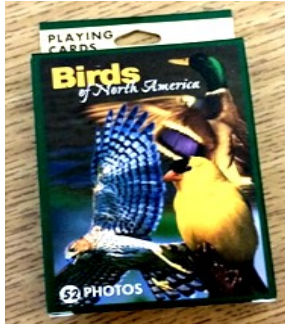
We have new items such as playing cards...

Remember all purchases from the store go directly to the Refuge to help fund projects and environmental education. Along with our memberships, it is our only source of income and we appreciate your interest in shopping at our little Shoppe.