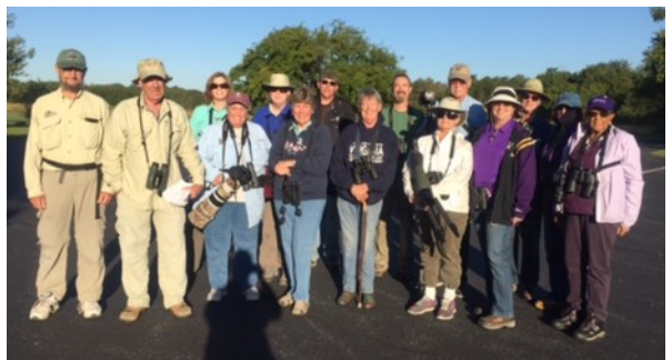
Friends' Bird Club at Prime Hook in September

November and December feature three more interesting field trips. In November, we will look for sparrows starting at Bombay Hook and moving south to the Little Creek Wildlife Area east of Dover, with several stops along the way. December features two outings: a field trip to Blackwater National Wildlife Refuge (another private tour!) and a bird walk at Bombay Hook to observe seasonal waterfowl.