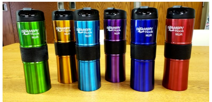
Insulated Tumblers; $23.75 each

Don't forget your frequent shopper card when you come in! for each $20 you spend, you get a check mark and after $100 spent, you get 15% off of your next total purchase!