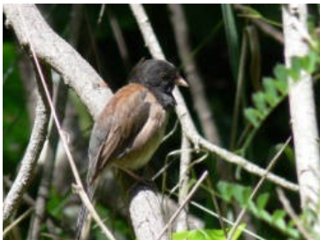
Dark-eyed Junco

Some of the species observed this period included Seaside and Saltmarsh Sharp-tailed Sparrows at the Boardwalk Trail, Cliff Swallows , Yellow-breasted Chat , Grasshopper Sparrows , Bobolinks , Warbling Vireo , Yellow-billed Cuckoo , Rough-winged and Bank Swallows , Lark Sparrow , Blue-winged Warbler , Northern Waterthrush , Nashville , Magnolia , Yellow , Prairie , Canada , and Chestnut-sided Warblers . Bruce Lantz and the FOBH