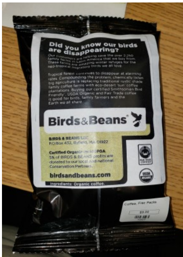
Frac Packs; $3.00 each

We still have some 2018 Flyway T-shirts on hand so get them before they are gone! We also have our hunter orange long-sleeve Tees and some ladies ¾ length sleeve wildflowers shirt.