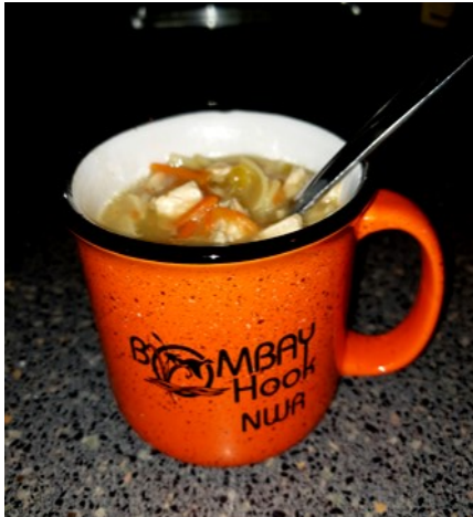
Campfire Mugs; $9.75

We have a few new items that I would like to introduce to you. We have some beautiful coffee/soup mugs in three colors just in time for the cooler weather. On the same note, we are now offering these colorful vacuum insulated tumblers to keep your beverages hot or cold while you are out enjoying our beautiful Refuge! Keeping in line with that, we are now offering frac packs of our Birds and Beans, bird-friendly coffee. These packs are good for one single pot of coffee....a nice gift with a couple of mugs added! Starting in mid-November, we will be putting together some gifts baskets to grab and go for your holiday gift giving.