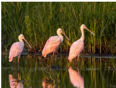
Three Spoonbills at Shearness Pool