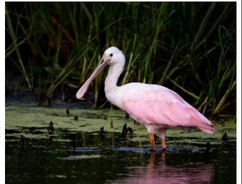
Roseate Spoonbill at Shearness Pool

Has everyone been out to see the Roseate Spoonbills? Strangers to our area, four of them showed up on the Refuge just after a storm this summer. The consensus is that maybe the storm blown them off course a little and they decided to stay for the season! Regardless of the reason, we were delighted to see such a bird here at Bombay Hook!