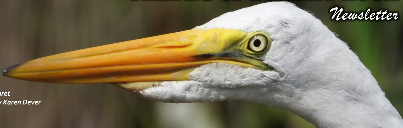
Great Egret